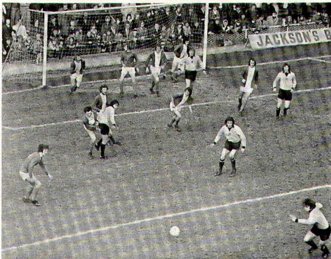
Sustained pressure by the Tigers against Carlisle United who put nine defenders in in the "box" to prevent the home side pressing home another attack.